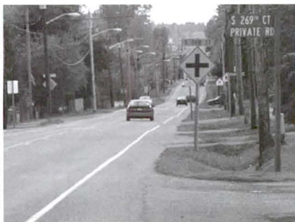
Define driveways adding curb, gutter, sidewalks and bike lane.

Property owners along the roadway will be directly contacted for permission to match existing properties with newly constructed walls, sidewalks and streets. A limited amount of right-of-way will be required for retaining walls and improving road curves.