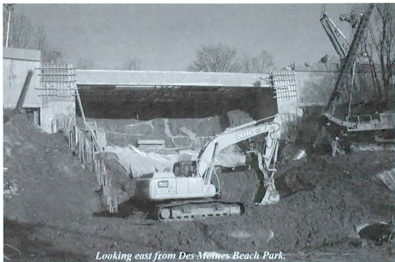
Looking east from Des Moines Beach Park.