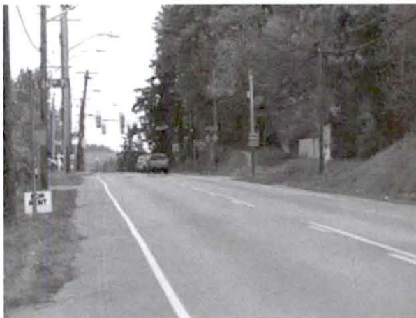
Left turn lanes and signals at intersections; replace paths with sidewalks.

The City of Des Moines Planning, Building and Public Works Department, is working with consultant KPG, Inc. to design improvements for 16th Ave. S. extending from S. 260th St. to S. 272nd St. The project involves numerous safety improvements